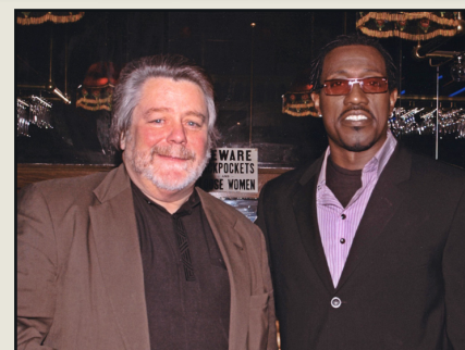
Dick With Wesely Snipes