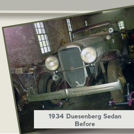
1934 Duesenberg Sedan Before